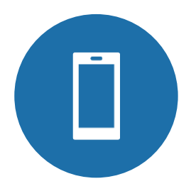
CALL TO STUDENTS