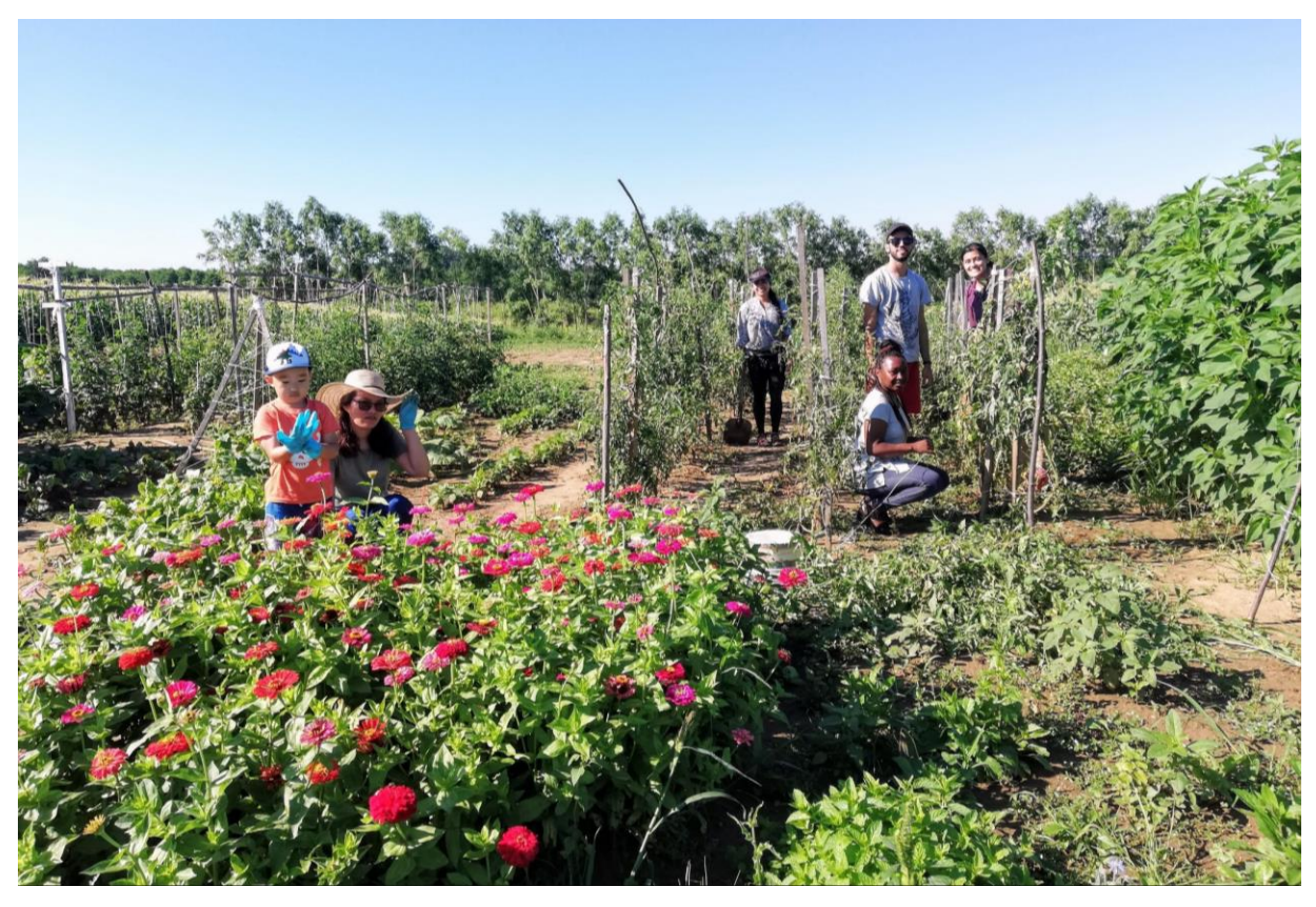
Thank you for your kind attention!