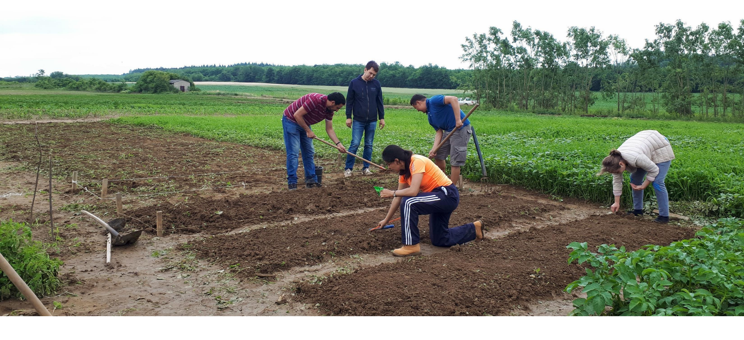
Planting and transplanting