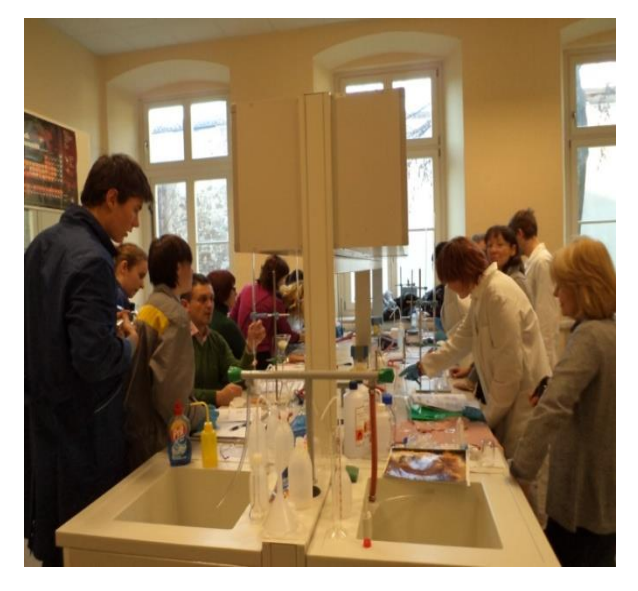
The investments have often been combined with HEIs funds